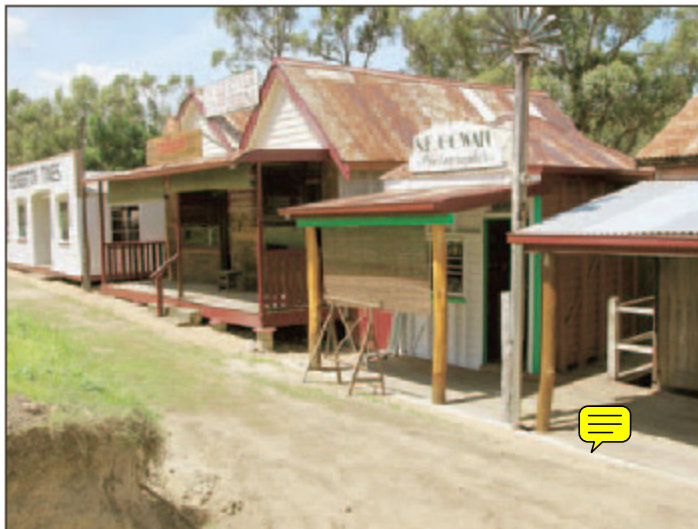
These antique buildings are part of a collection that date back to 1868.

Thirty of the buildings will be open early next month, with the oldest